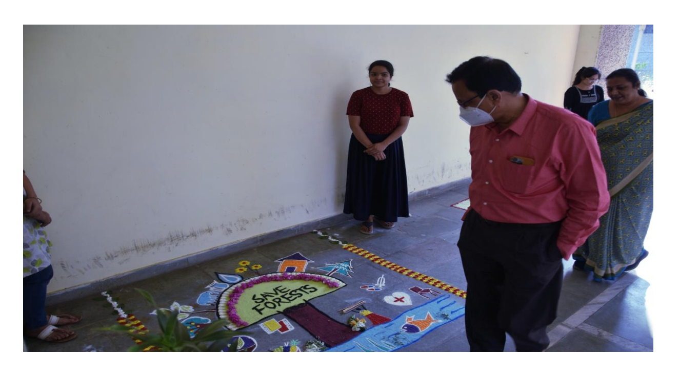
Director, TFRI visited and interacted with participants of Rangoli competition