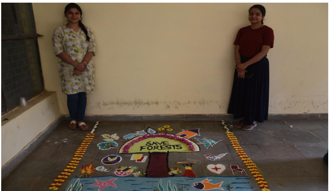
Participants with their rangoli on the theme