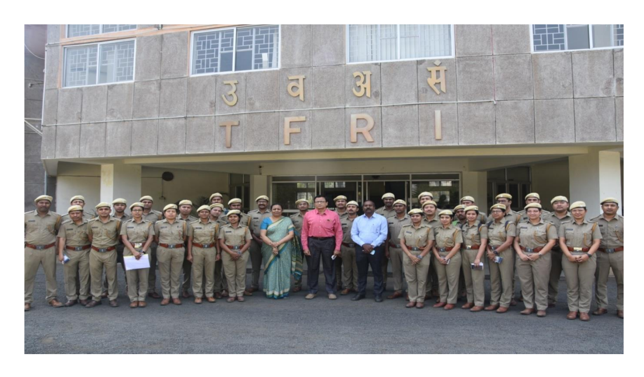
A group of Range Forest Officer, Batch 2021-22 , CASFOS, Coimbtore