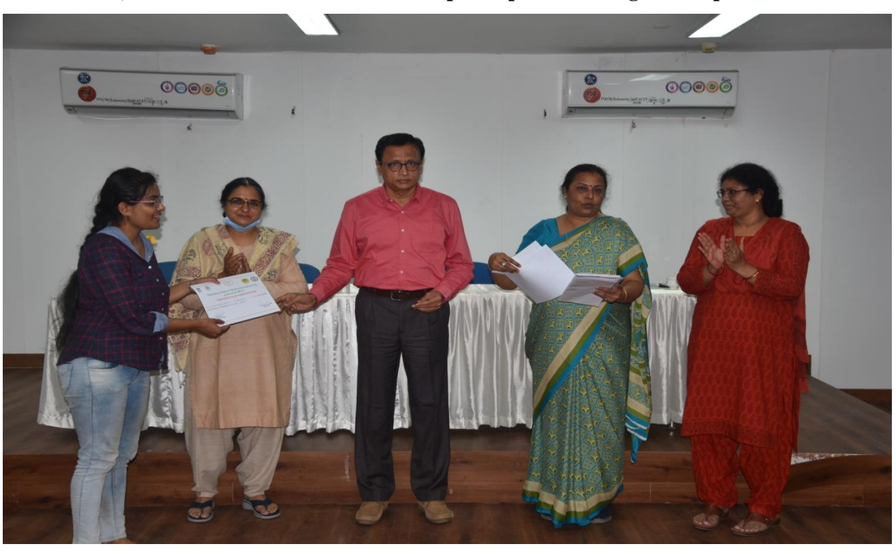
Distribution of Certificates to the participants